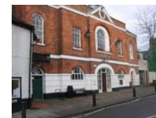
Avoid cluttering this historic facade