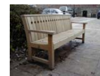
Proposed new seat