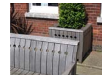
Matching furniture proposed