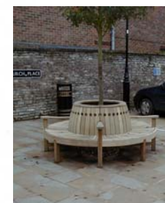
Proposed tree seat