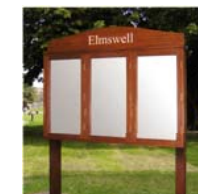
Proposed style of larger notice board