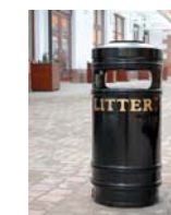
Proposed litter bin