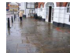
Limited space – must avoid clutter