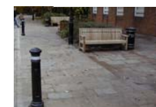
Example of seat and paving