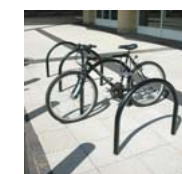
Proposed cycle stand